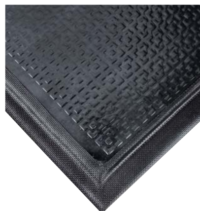
Texture-Top No. 491: for dry to damp work areas where traction is not critical. Easy-to-clean surface.