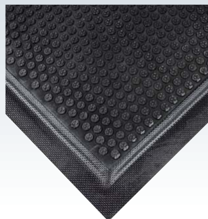
Grip-Top No. 490: for wet work stations where maximum traction and/or scraping is crucial.

Colours: Black or Black with Yellow Safety Border